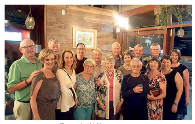
Teams in Wellington 2016.

involved in marriage ministries including Teams, from 1995 until about 2000.