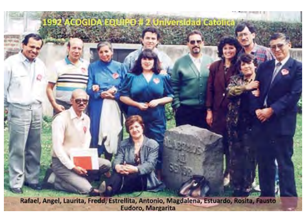
Ecuador, Quito Team No. 2, 1992.

After a Formation Day in Bogotá in 1991, in which couples from Team Quito 1 and its SC were invited, Team 2 was formed with couples related to the Don Bosco Technical School. In 1992 Teams 3 and 4 started.