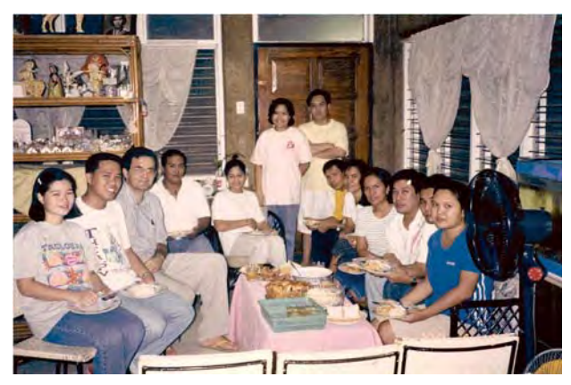
Meeting of Cebu 1.

The first team was formed with couples who lived and worked in the community where the Casa de Formación Escolar is located, in Guadalupe, Cebu City. Coincidentally, the island of Cebu is where Christianity was also first introduced to the Philippines in 1565.