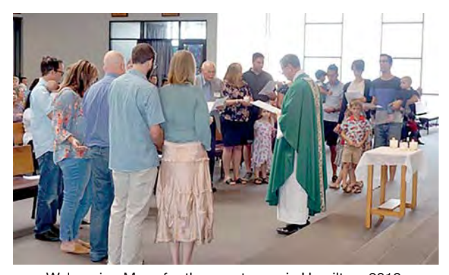
Welcoming Mass for the new teams in Hamilton, 2019.

The Responsible Couples from each of the three cities formed the first Sector Team in this new phase of the Movement in New Zealand. In 2019 they attended a Formation Retreat in Australia to more deeply experience the Movement of Teams of Our Lady.