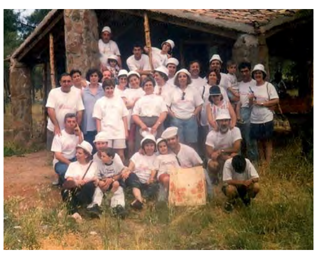
Illescas Sector, Teams Santa Cruz 1 and 2.

Thus, the Movement began its rapid spread throughout Spain. In barely five years the teams in Spain multiplied by six. In the 64-65 school year there were already 277 teams, distributed in three Regions: Barcelona (including the Northeast of Spain from the Basque Country and Navarre), The Middle (including the Northwest of Spain up to Galicia) and South (including Extremadura, Andalusia and Levante).