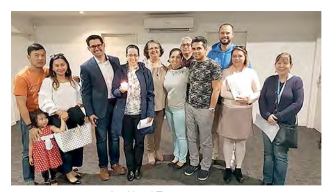
Auckland Team 1, 2019.