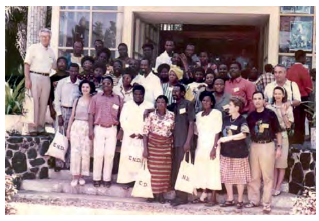
Delegation from Togo to the Training Session with some members of the ERI. July 1997.

Thanks to the dynamism and determination of the Togo Teams, Teams was born in Benin in 1997, The Ivory Coast in 2008 and Guinea in 2013. Togo, the true locomotive of the maritime region of the West, prides itself on being among the pioneers of the Movement in these countries.