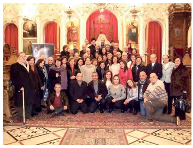
Syria 2019. Members of Teams.