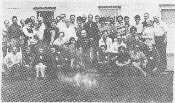
"Our Gang" takes time out for a picture