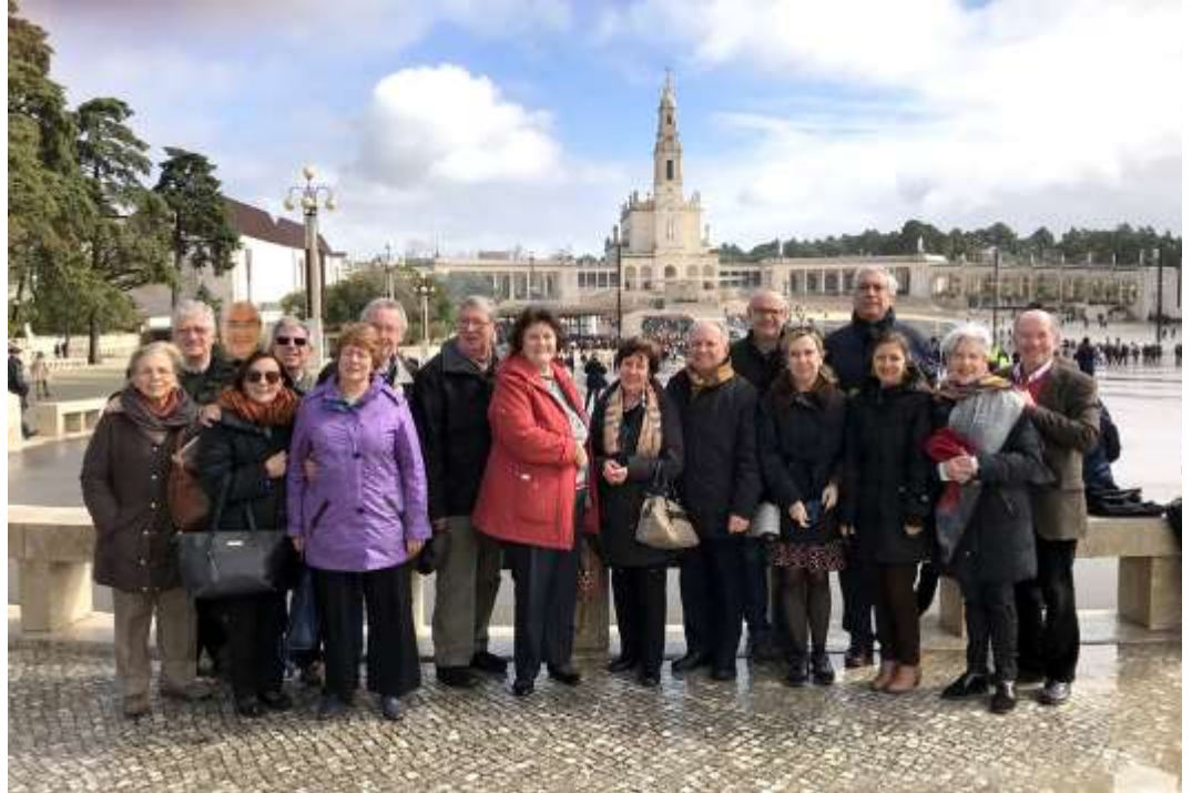
The ERI in front of the Esplanade of the Fatima Sanctuary

The Portugal Super-Region welcomed and looked after the ERI with great kindness, friendliness...and efficiency. We warmly congratulate them and thank here!