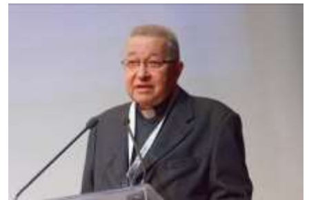
Monsignor André Vingt-Trois, Cardinal-Archbishop of Paris closed the Colloquium

In the evening of December 8 th , the 70 th anniversary of our Charter was celebrated at a mass presided over by Monsignor Eric de Moulins-Beaufort, Auxiliary Bishop of Paris, in the Church Saint-Augustin in Paris.