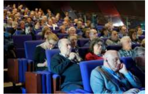
A full amphitheatre, an attentive audience of over 250 people from all over the world. All the correspondents were present!

4 half-day sessions enabled attendees to listen to talks and round-table discussions, given by numerous international speakers, as well as to see clips put together and filmed by Team members throughout the world ... The discussions were broadcast live and can be seen on www.equipes-notre-dame.com