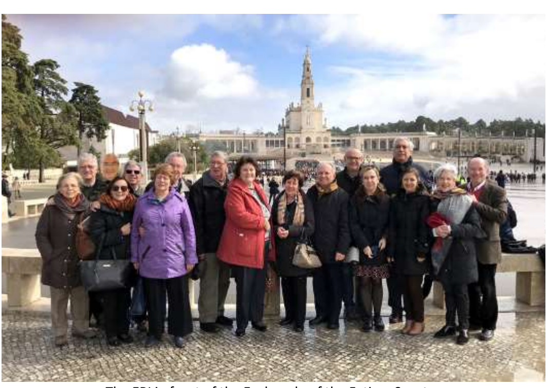
The ERI in front of the Esplanade of the Fatima Sanctuary

The Portugal Super-Region welcomed and looked after the ERI with great kindness, friendliness...and efficiency. We warmly congratulate them and thank here!